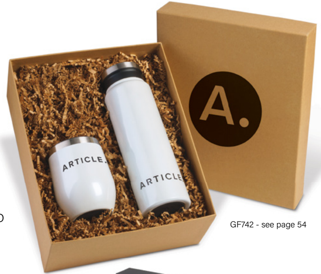
GF742 - see page 54

The easy, hassle-free form is available on-line; just send it along with your PO and leave the rest to us!