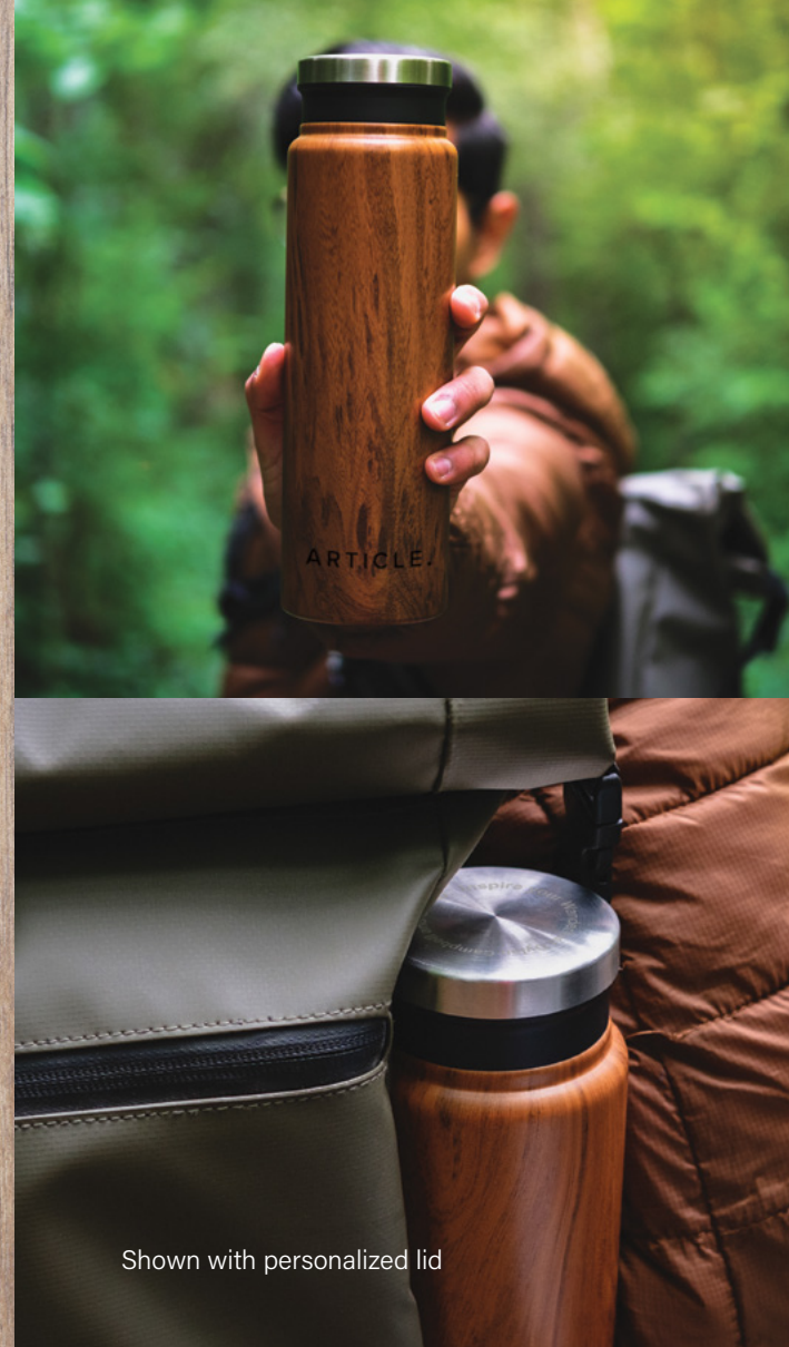
Shown with personalized lid