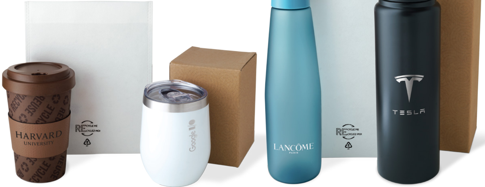
RECYCLED POLYPROPYLENE POUCH