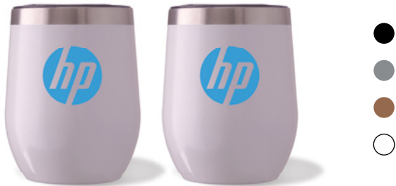
GF737 SMALL TALK TWIN KIT DW403 SMALL TALK x 2 P711 2-PC ECO GIFT BOX AND RECYCLED CRINKLE PAPER