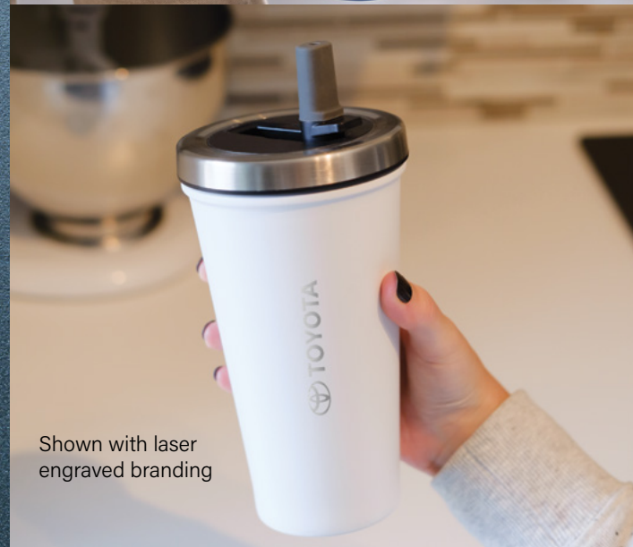
Shown with laser engraved branding