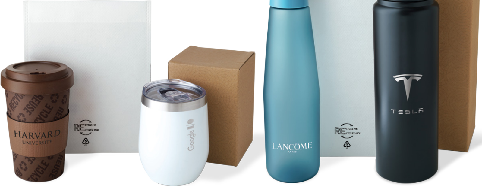
RECYCLED POLYPROPYLENE POUCH