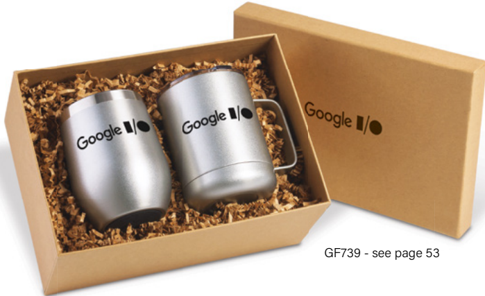
GF739 - see page 53