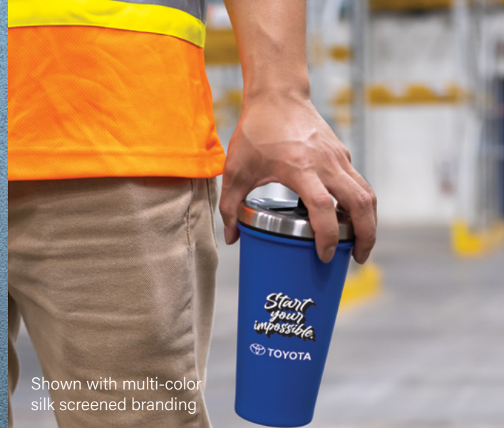
Shown with multi-color silk screened branding