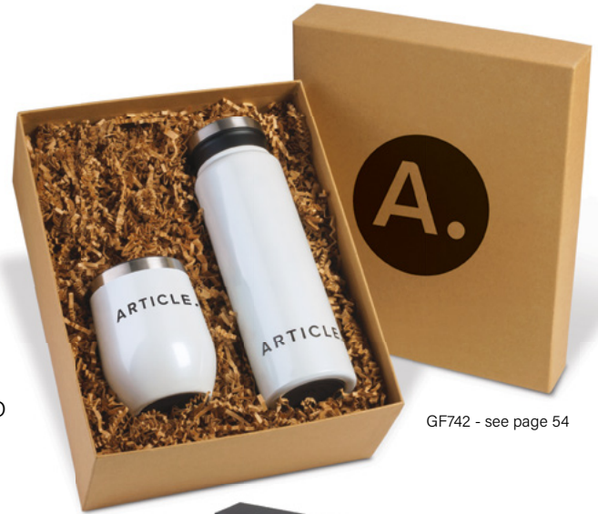
GF742 - see page 54

The easy, hassle-free form is available on-line; just send it along with your PO and leave the rest to us!