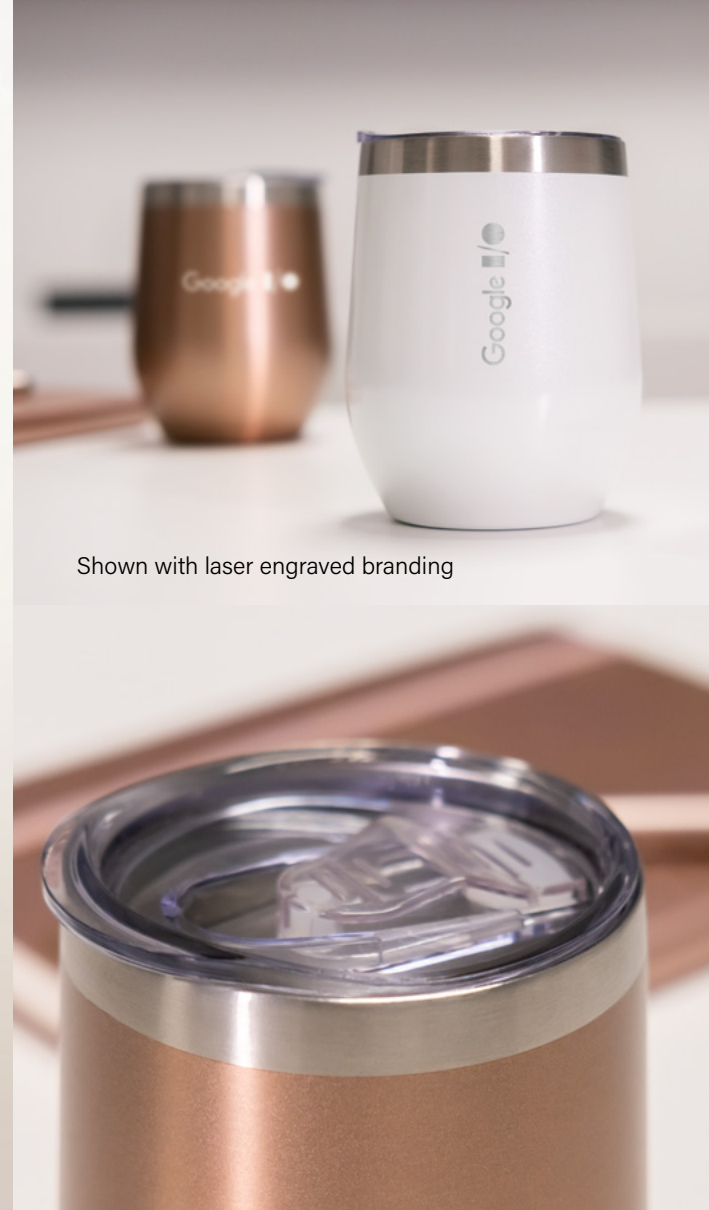
Shown with laser engraved branding