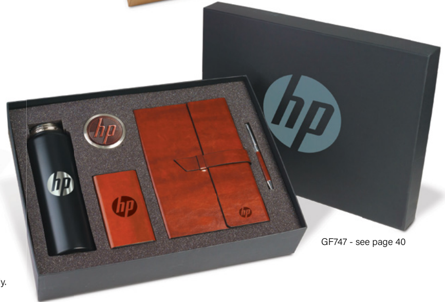
GF747 - see page 40

*Please contact your Account Manager for additional costs. Standard freight charges apply.