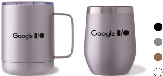
GF739 MEAN MUGGIN' x SMALL TALK TWIN KIT DW403 SMALL TALK DW406 MEAN MUGGIN' P711 2-PC ECO GIFT BOX AND RECYCLED CRINKLE PAPER SEE PAGE 48