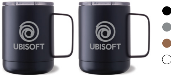
GF738 MEAN MUGGIN' TWIN KIT DW406 MEAN MUGGIN' x 2 P711 2-PC ECO GIFT BOX AND RECYCLED CRINKLE PAPER