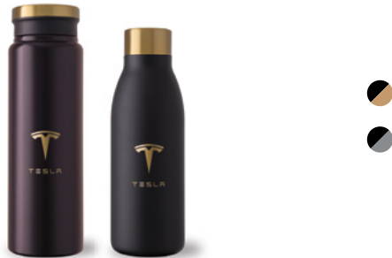
GF740 TREND SETTER x TOP NOTCH REFLECTION TWIN KIT DW302 TREND SETTER REFLECTION DW306 TOP NOTCH REFLECTION P9124 2-PC ECO GIFT BOX AND RECYCLED CRINKLE PAPER