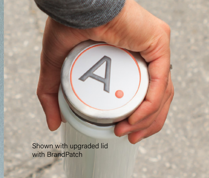
Shown with upgraded lid with BrandPatch