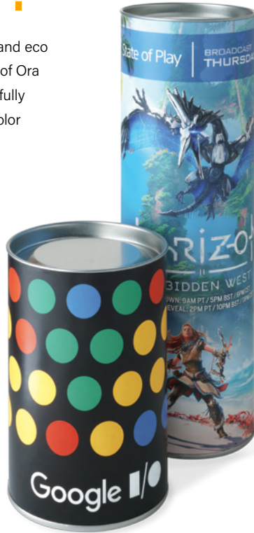
UPGRADED TUBE PACKAGING

Two sizes of tubes (small/large) 4-color process full-wrap imprint Matte silver lid on both ends Setup: $80.00 (c)