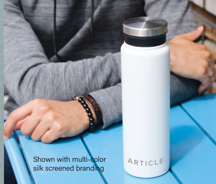
Shown with multi-color silk screened branding